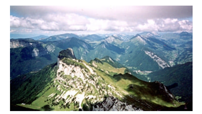
From personal experience we'd strongly recommend Camping L'Horizon, at the top of the hill above Talloires, right next to the Perroix landing field and the hitching point to the main launches.

On non-flyable days the old quarter of the town (sometimes known as Le Vieil Annecy and not to be confused with Annecy Le Vieux) is a delight for the casual stroller amongst its restaurants and shops, or you can try your hand at something aquatic - it's all there. Jump in the car / on a bike (of whatever variety, but the term 'push-bike' may become very apt in this terrain!) and you can also tour some spectacular scenery. If you're taking the family, there are plenty of friendly campsites and all the facilities you need. Your more adventurous companions can easily get a tandem flight too.