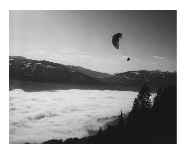
Paraglider on Plan Joux, Chamonix