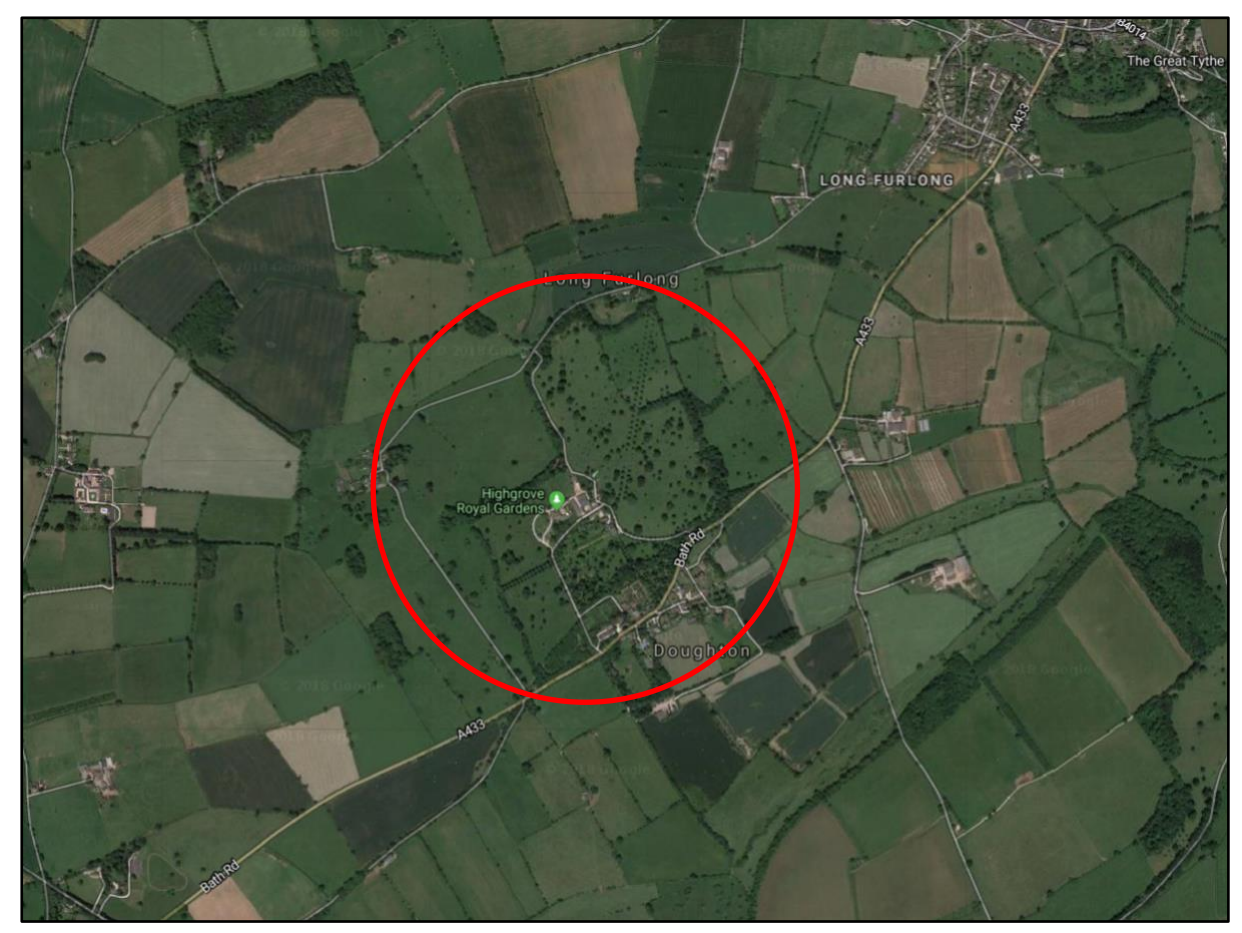
Figure 1. Highgrove House Prohibited Area (HHPA)